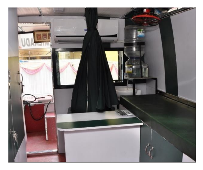
Doctor's table and patient examination desk inside the MMU