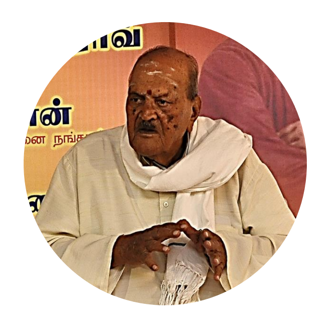
Suru-ji addressing the gathering