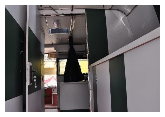
MMU Pharmacist's counter

An area coordinator identified at each of the 12 locations together with and a four-member volunteer team will be responsible for the logistics and communication with the beneficiaries at their respective locations.